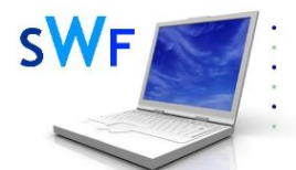
SIMPLE WEBSITES Fast

Visit us online to learn more about our services, view our portfolio, and read our client testimonials. We welcome the opportunity to earn your business.